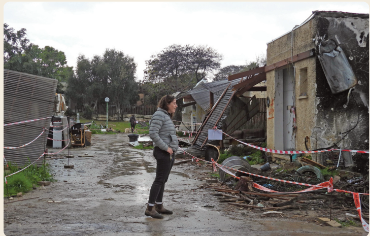
A visitor surveys the destruction of homes on Kibbutz Kfar Azza after October 7.