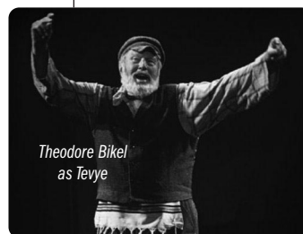
Theodore Bikel as Tevye

Watch for more details and a link to register in the TBE Connection.